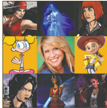
Voice actor Kat Cressida.